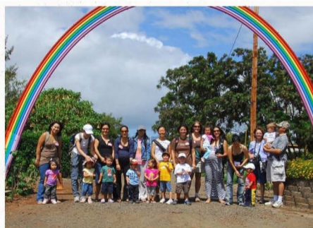
Field Trip Friends takes parents and young children on educational adventures.